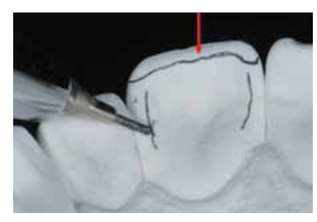
FIG. 12 The AFAP goal is to realise a zirconia incisor margin.