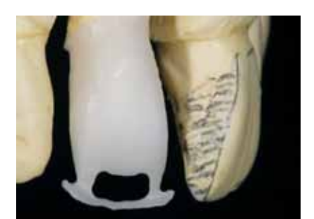
FIG. 24 Zirconia structure following the AFAP concept design: the zirconia connectors are placed strategically.