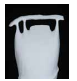
FIG. 14 Presintered zirconia structure following the AFAP concept design.