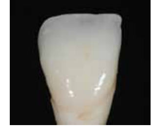
FIG. 20, 21 After ceramic veneering the incisal zirconia margin excellently reproduces the halo effect of a natural tooth.