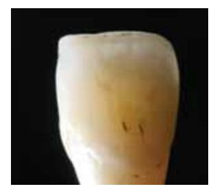
FIG. 22 View under reflected light.

22). Realisation of the incisal edges areas with zirconia material allowed a greater exploitation of the extremely low abrasive characteristics of the polished zirconia (19-20): as a result, this safequarded the integrity of the opposite teeth. The goal was to create an incisor margin in zirconia which was not, however, made by a complete palatal wall in zirconia: indeed, this would compromise the aesthetics of the incisal area by partially blocking the passage of light and would alter the transparency and the effects of opalescence in this area. Under the zirconia structure an empty space was created where the veneering ceramic (Ice Zirkon Keramik, Zirkonzahn S.r.l.) could be stratified, thus allowing the passage of light in a natural way. The zirconia structure should therefore be made with thin vertical connectors that presented maximum thickness in the palatal-facial surfaces and create the essential empty space. These connectors should be placed in alignment to the semi-opaque