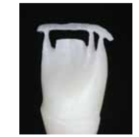
FIG. 16-18 Facial and palatal view of the zirconia structure after sintering.