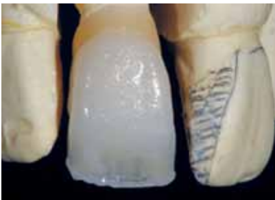
FIG. 26 After the first ceramic bake an excellent chromatic integration of the zirconia structure is achieved.