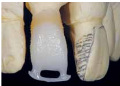
FIG. 25 Dynamic dentin layered in the incisal area to lower the luminosity of the crown.