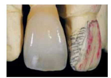
FIG. 29 The crown after polishing.

structures of the dental mamelons which were planned by following a precise chromatic analysis. These zirconia protectors were then covered by the veneering ceramic, in both the facial and palatal areas, thus becoming an integral part of the chromatic complex (Fig.23-30).