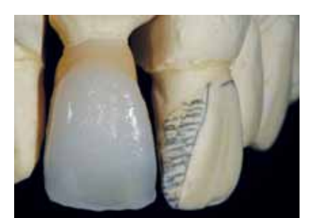
FIG. 27 Second bake.