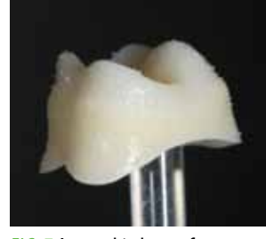
FIG. 7 A very thin layer of veneering ceramic allows excellent results with regard to hue, chroma, fluorescence and value, thanks to the irregular surface of the prosthetic structure.

FIG. 3-5 Hands-on demonstration of AFAP concept design for posterior zirconia crowns. The tapered shape of the zirconia structure is similar to that of a natural tooth.