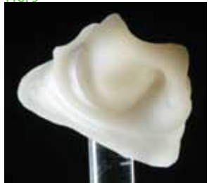
FIG. 6 Light transmission through the zirconia structure.