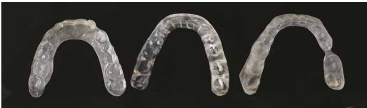
FIG. 5 Splint produced with a multi-jet 3D printer and verified on the prototyped casts.