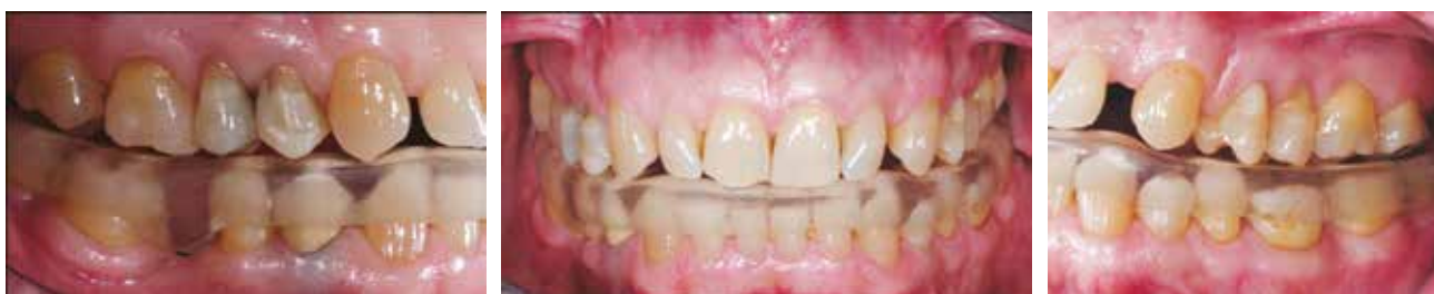
FIG. 6 Intraoral pictures of the splint immediately after delivery.

The authors presented a technique to manufacture