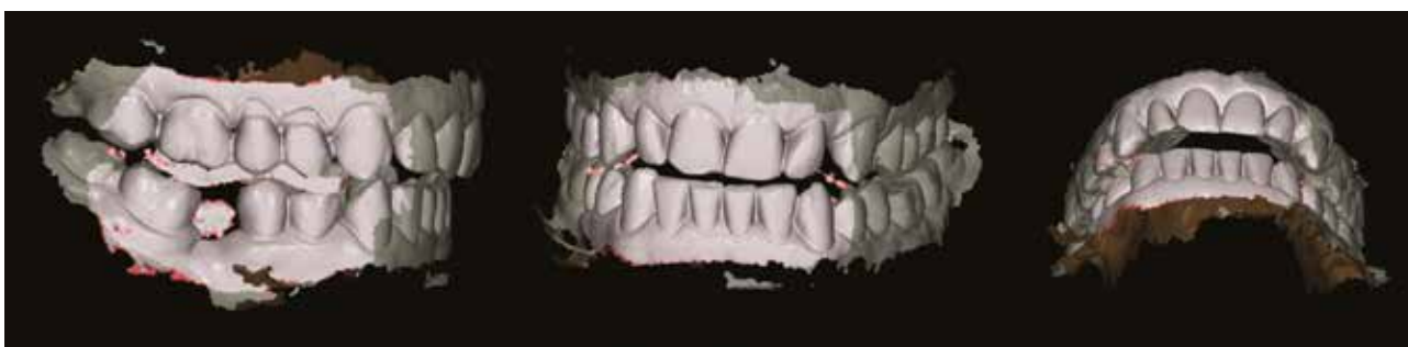
FIG. 2 Intraoral scan with dental arches at the correct vertical relationship as obtained with Dawson's manipulation.

The intraoral scans of the maxillary and the mandibular arches presented enough points in common with the bite registration to have the maxillary and mandibular arches "digitally mounted" with the same intermaxillary relation of the wax index recorded with Dawson's centric relation technique (Fig. 2).