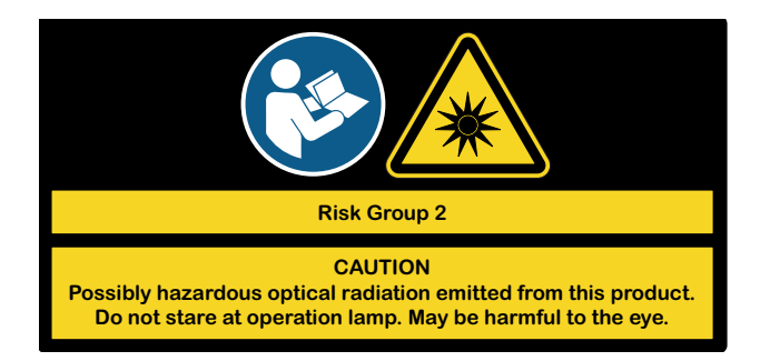
FIG. 3 Example of labeling a product with Risk Group 2 optical radiation (Graphic: C. Prall, smart optics Sensortechnik GmbH).

that may emanate from a product, including the hazards of blue light.