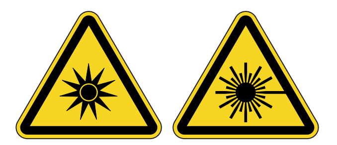
FIG. 2 Warning sign against optical radiation (left) and warning sign against laser radiation (right) (Graphic: C. Prall, smart optics Sensortechnik GmbH).

A well-designed 3D scanner can be expected to operate safely without any need for the user to wear protective goggles, posing no risk to the user. A manufacturer cannot shirk its responsibilities by affixing warning labels and transferring responsibility to the operator (Fig. 2, 3). Rather, a manufacturer is generally obliged to ensure the safety of the products it places on the market. This includes all known or foreseeable hazards