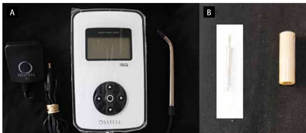
FIG. 2A,2B Ostell mentor device (A) SmartPeg and Transfer cap (B).

performed. Paired t test was used to find differences between buccal and palatal region. Repeated measures ANOVA was used to find difference within the groups in buccal and palatal in the two techniques. P < 0.05 was considered significant.