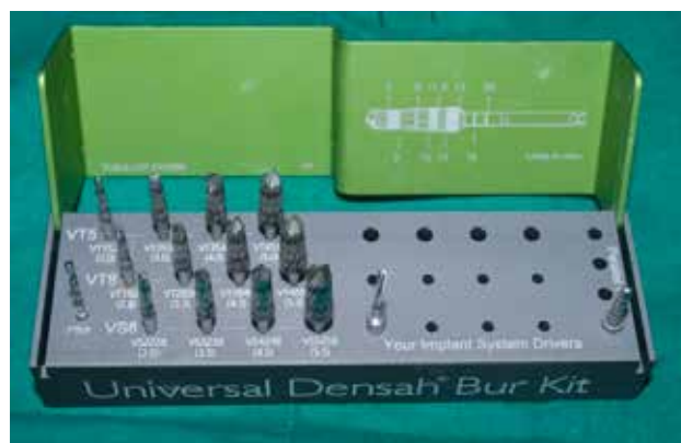
FIG. 1 Densah bur kit for osseodensification.

A prophylactic antibiotic therapy (Amoxicillin 500mg+Clavulanate 125 mg) was administered to the patient before the procedure (i.e. the previous night and on the day of the procedure) as per Misch's Protocol. Patients were advised to continue with antibiotic therapy for five days. Patients were to begin analgesic