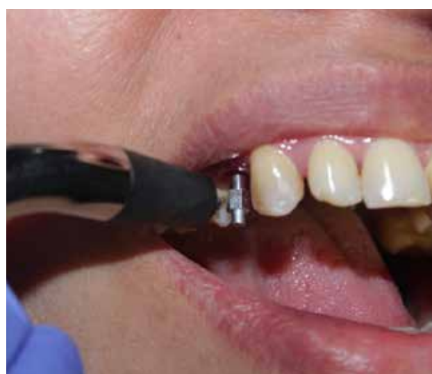
FIG. 3 Measurement of ISQ with smartpeg.

The comparison of implant stability quotient values between the two techniques at time of placement, 3 months and 6 months after with respect to buccal and palatal region, showed that the mean ISQ values were not significant in between the two groups (Table